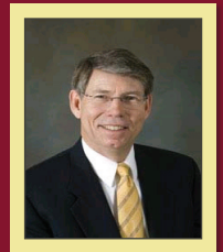
Florida Attorney General Bill McCollum